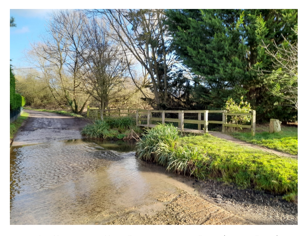
Produced by Save Our Loddon Valley Environment at Hall Farm. (SOLVE Hall Farm).

You can donate money to support Save Our Loddon Valley at Hall Farm (SOLVE Hall Farm) through the just giving page here: https://www.green4grow.org/funding